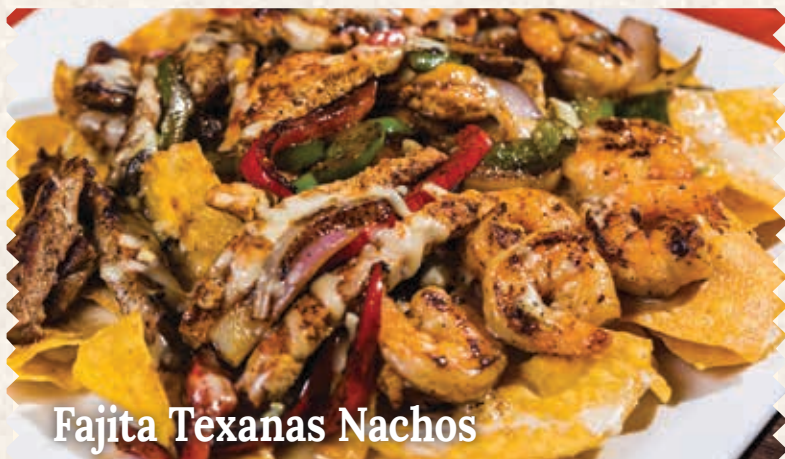
Fajita Texas Nachos

Mixed greens, onions, tomatoes and cheese - $5