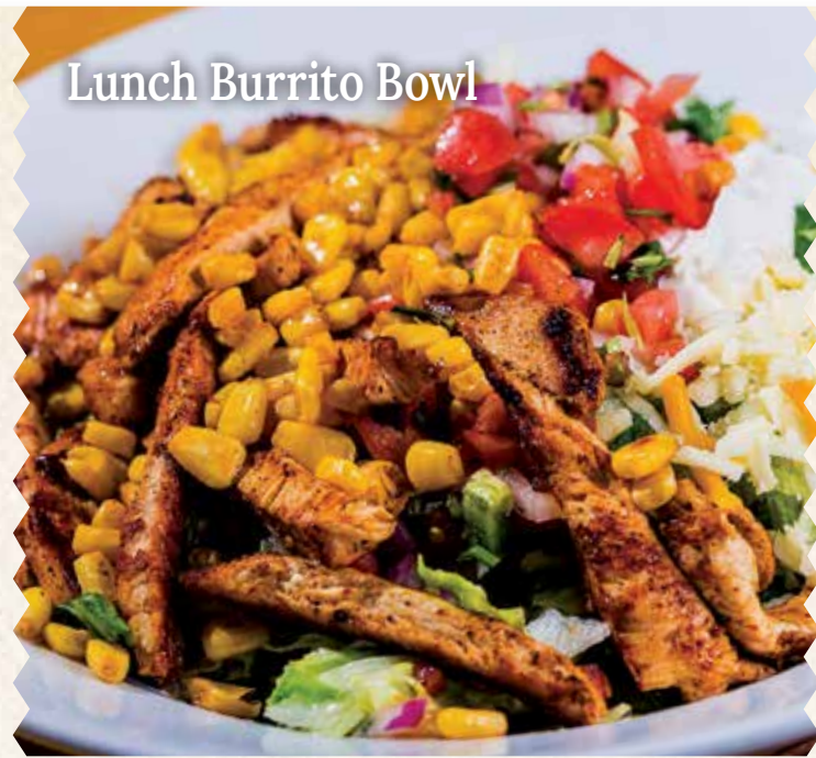
Lunch Burrito Bowl

Nachos topped with ground beef, shredded chicken, refried beans, melted cheese, lettuce, tomatoes and sour cream – $9.5