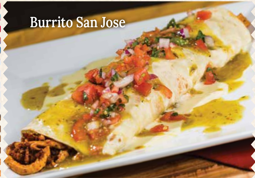
Burrito San Jose