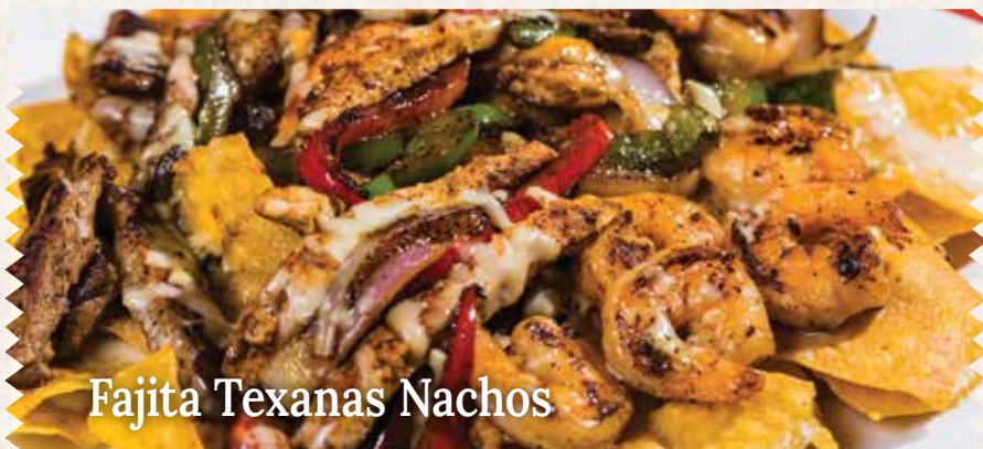
Fajita Texasan Nachos