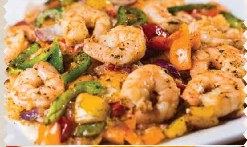
Arroz Con Camarones

Two grilled tilapia fillets topped with grilled scallops and chipotle sauce. Served with rice and an avocado salad - $19