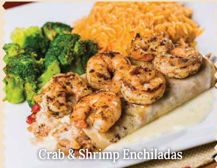
Crab & Shrimp Enchiladas

Two corn tortillas stuffed with grilled crab meat, roasted red peppers and red onions covered with cheese sauce and topped with grilled shrimp. Served with grilled vegetables and rice - $18